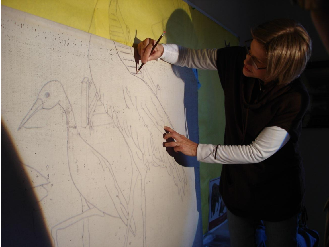
Mosaic Project – Wetland Theme