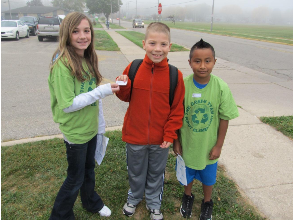
Green Team Walk to School Day