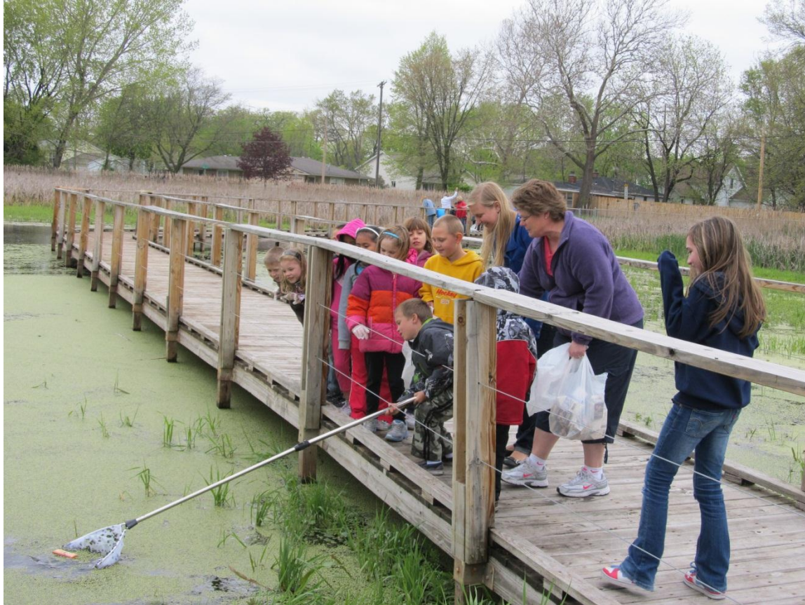
CLC Waterpark Green Team Wetland Walk