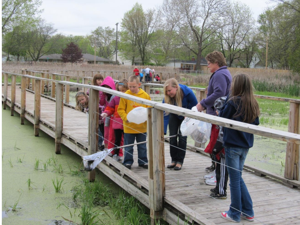
CLC Waterpark Green Team Wetland Walk