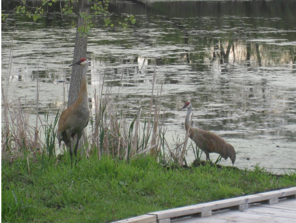
Sandhills at the Wetland