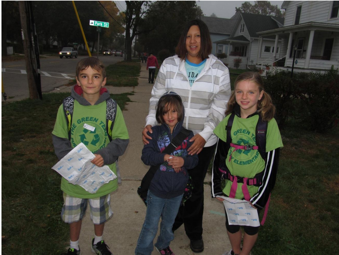
Green Team Walk to School Day