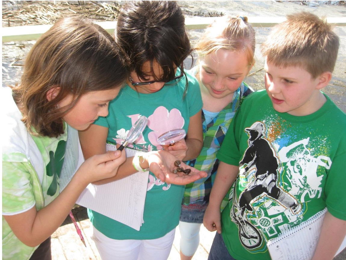
Inspecting Pond Life - Snails