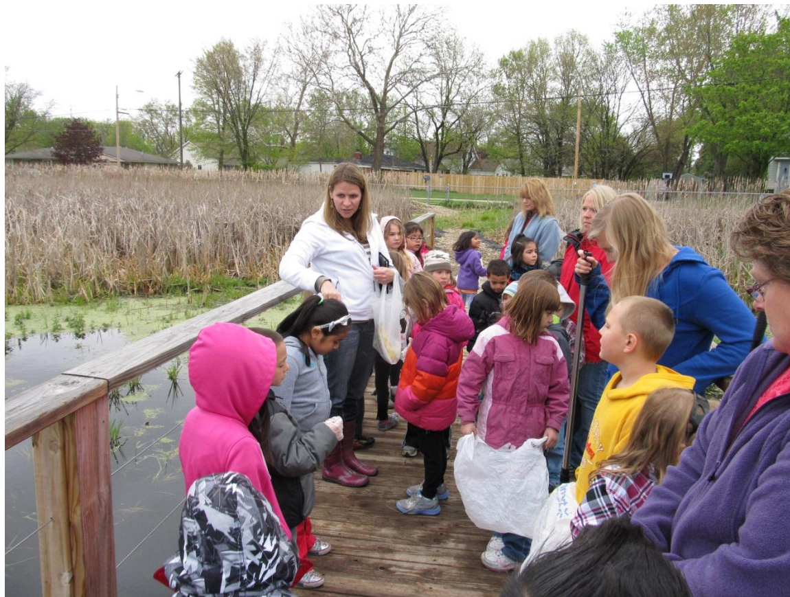
CLC Waterpark Green Team Wetland Walk