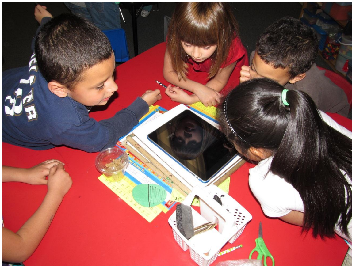
Looking at Wireless Proscope Image at 30X Power