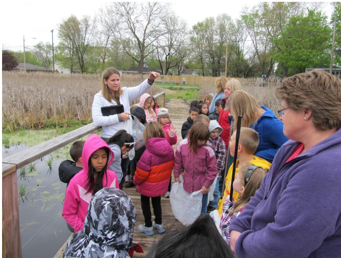
CLC Waterpark Green Team Wetland Walk