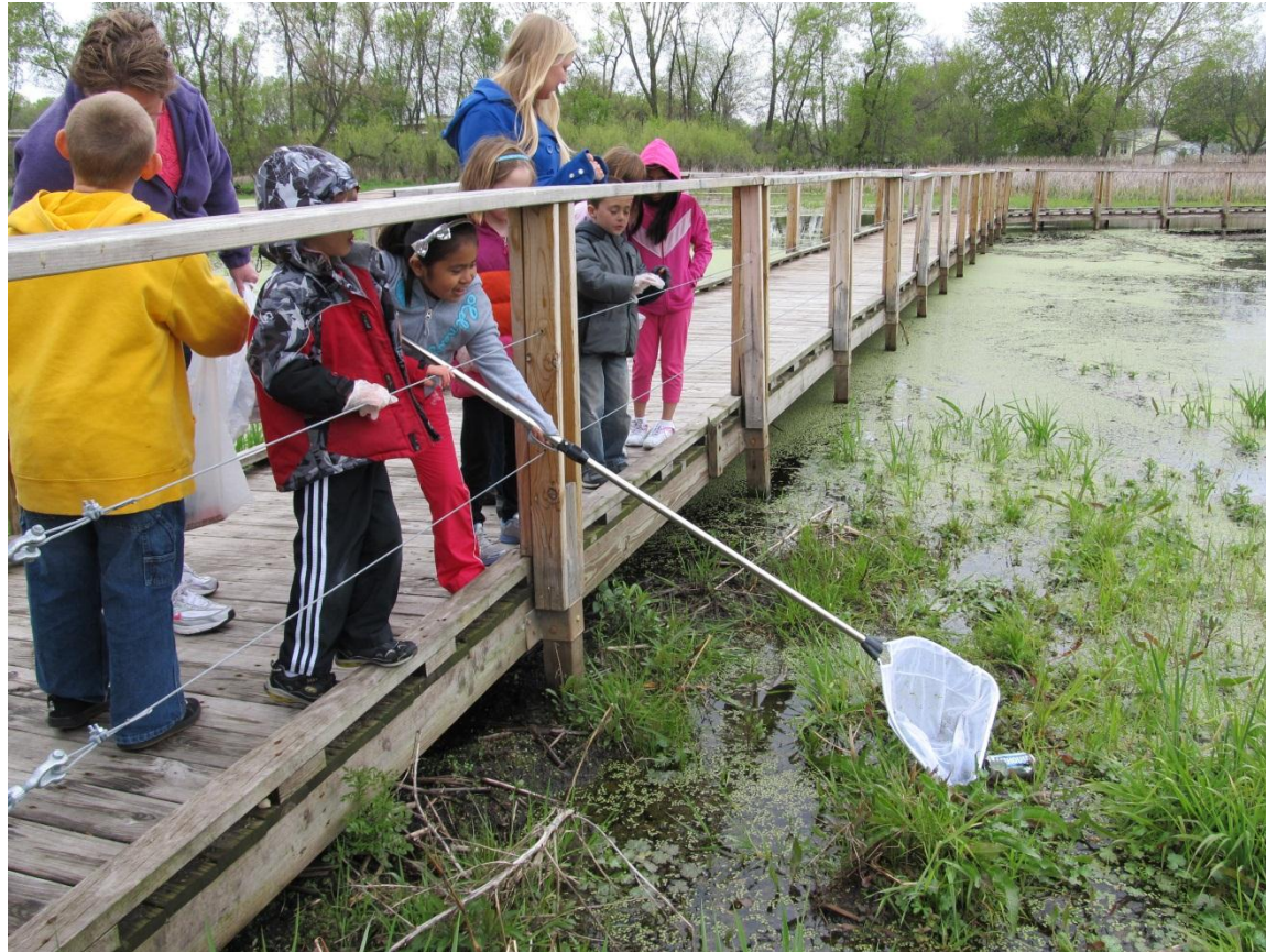
CLC Waterpark Green Team Wetland Walk