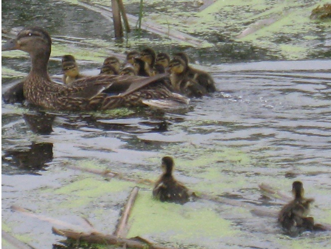
A Just Released Hen and Brood