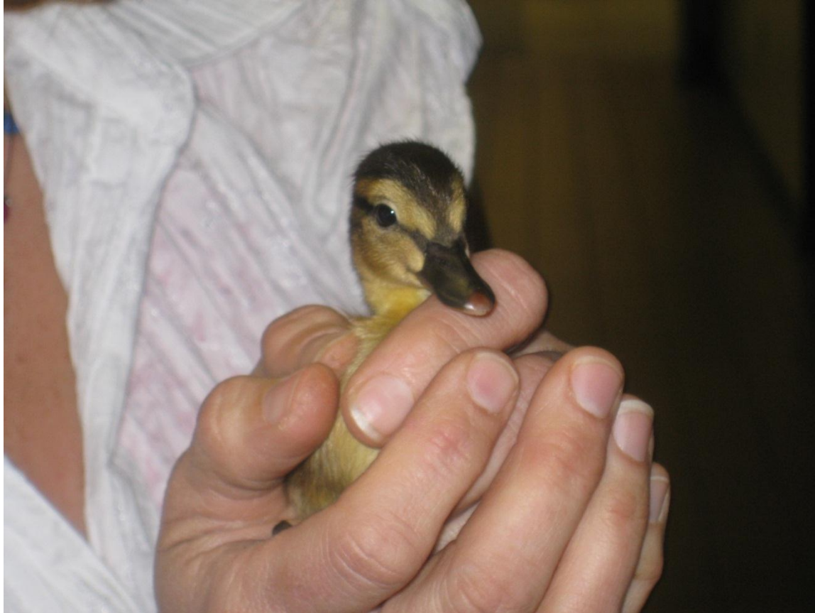
Duckling on the Loose!