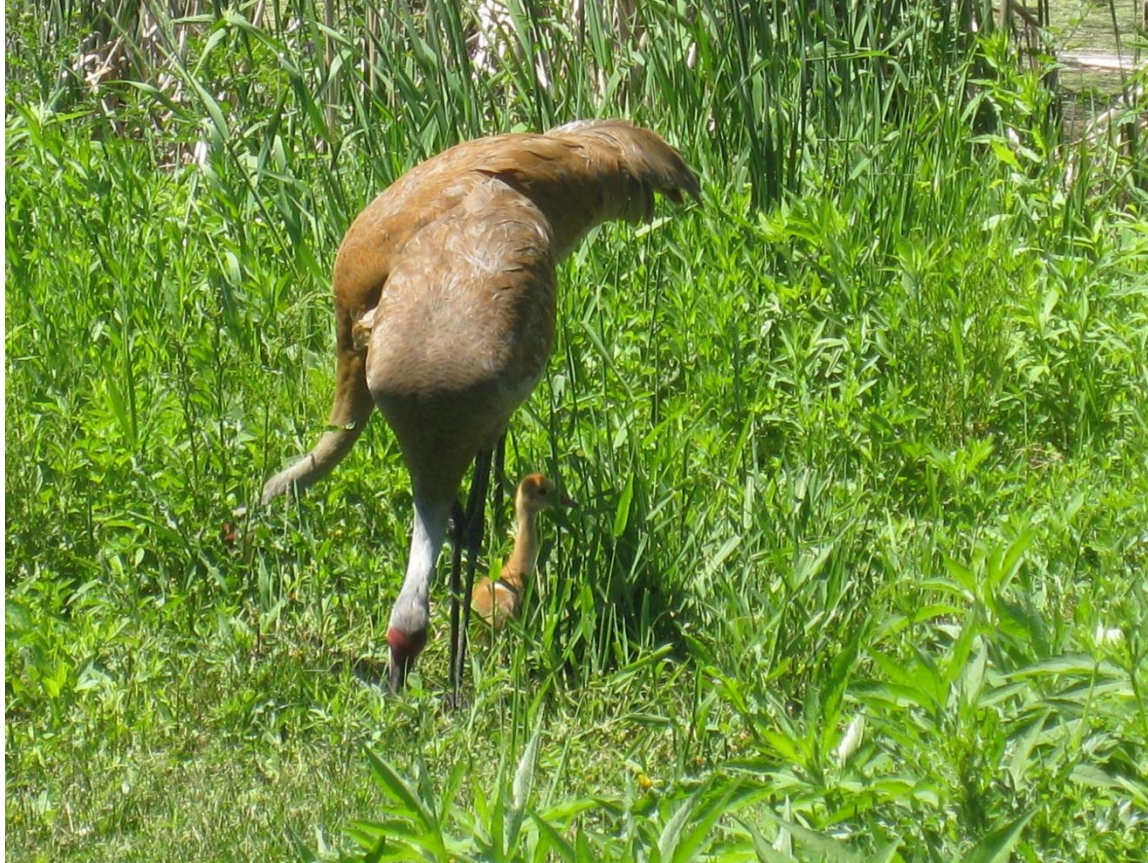
Sandhill Crane Family