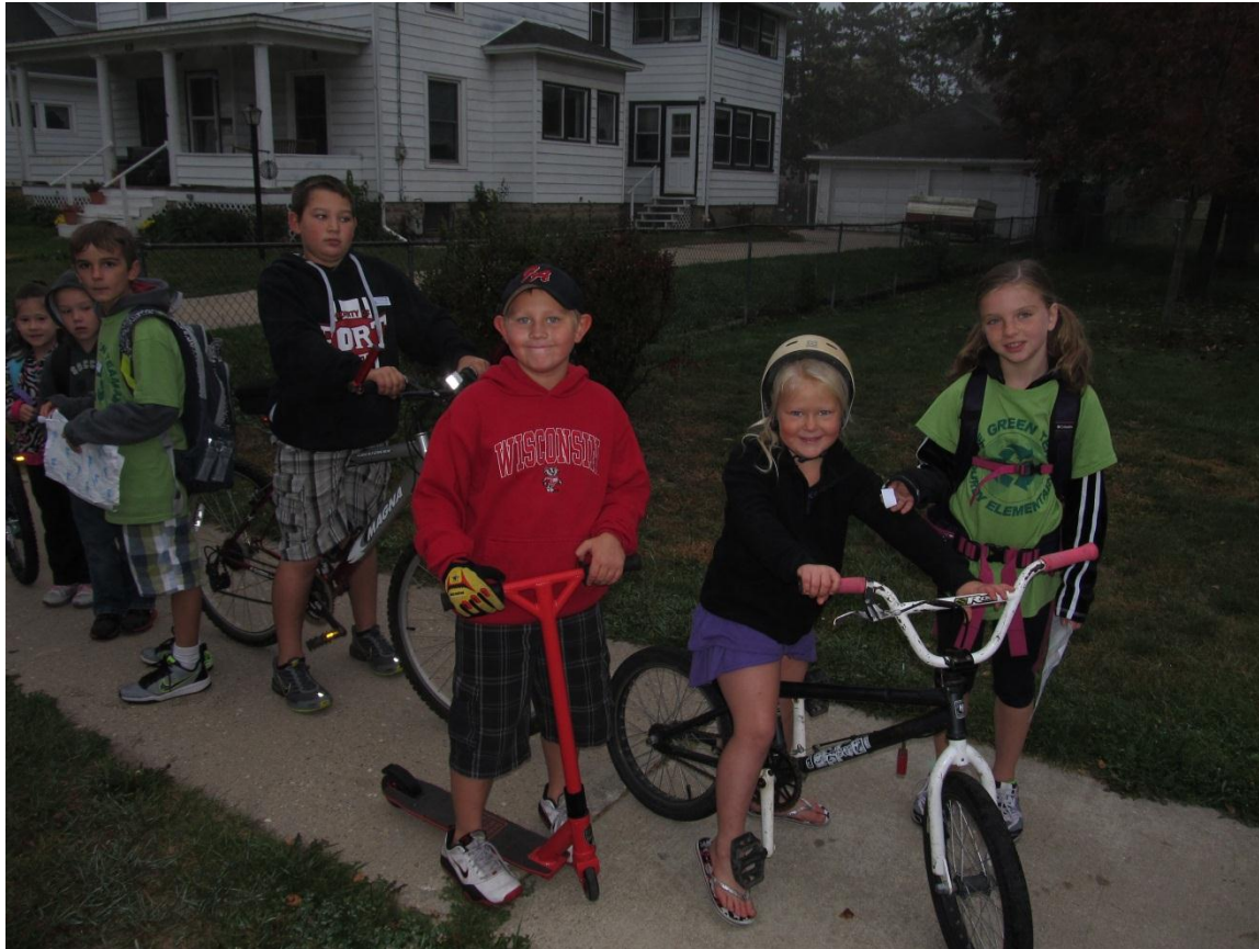
Green Team Walk to School Day