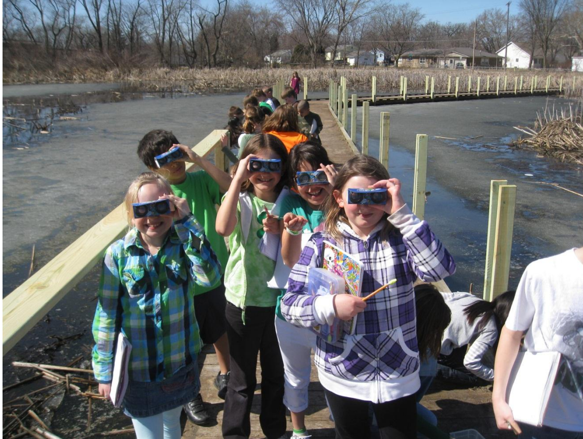
Early Spring Wetland Walk