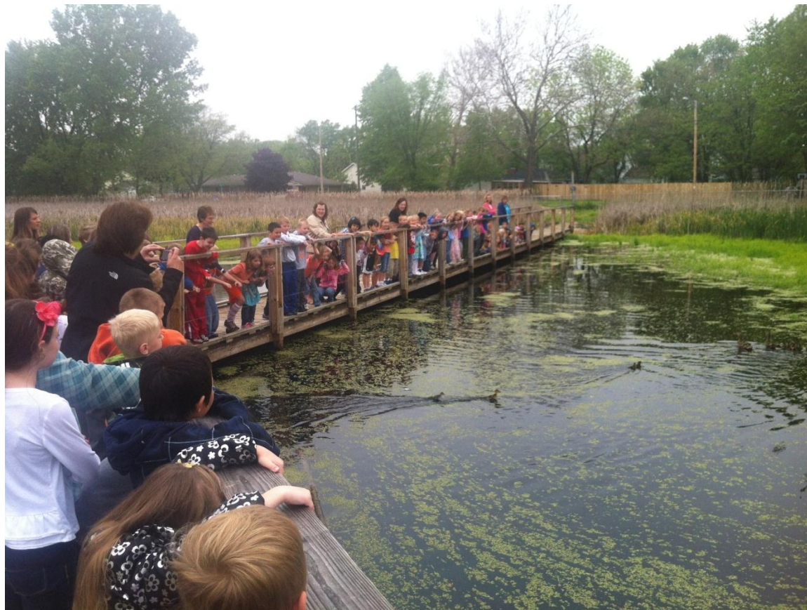
Duckling Release at Wetland