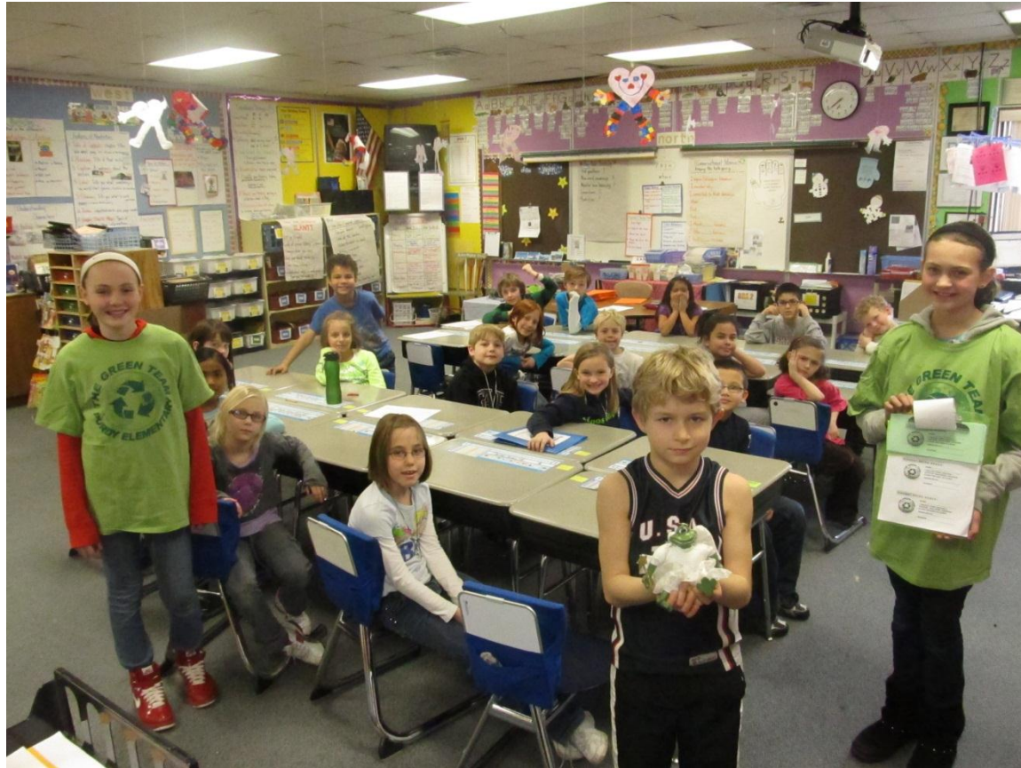
Green Team Class of the Week With “Eartha the Frog”