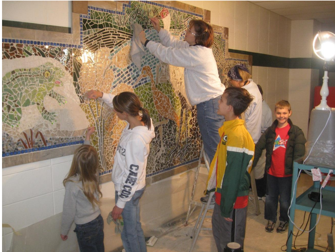
Mosaic Project – Wetland Theme