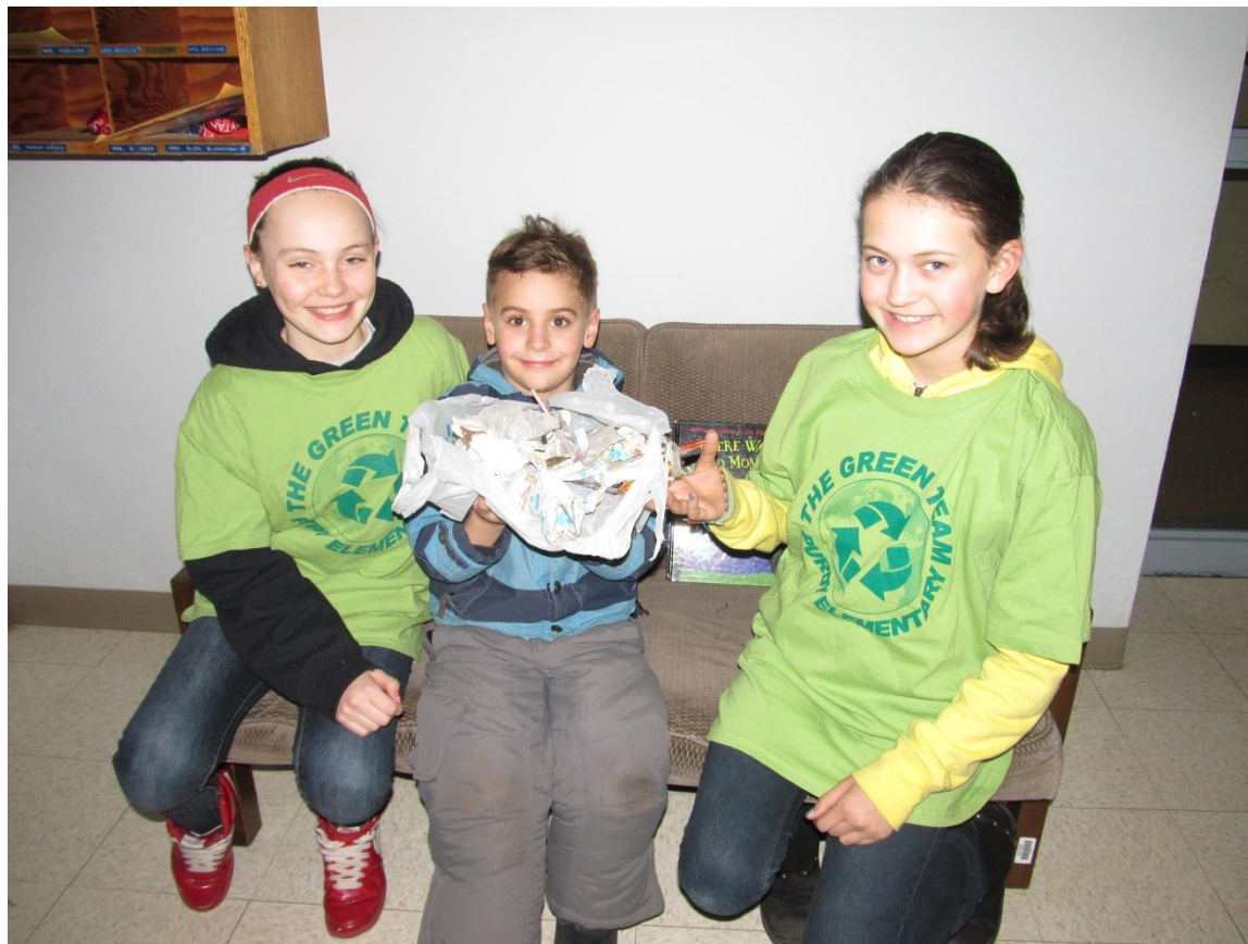
Picking up Litter on Playground- Caught Being Green!