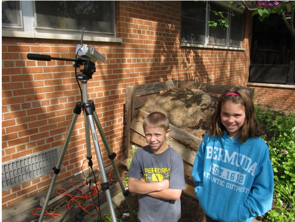
Nesting Mallard on Mallard Cam