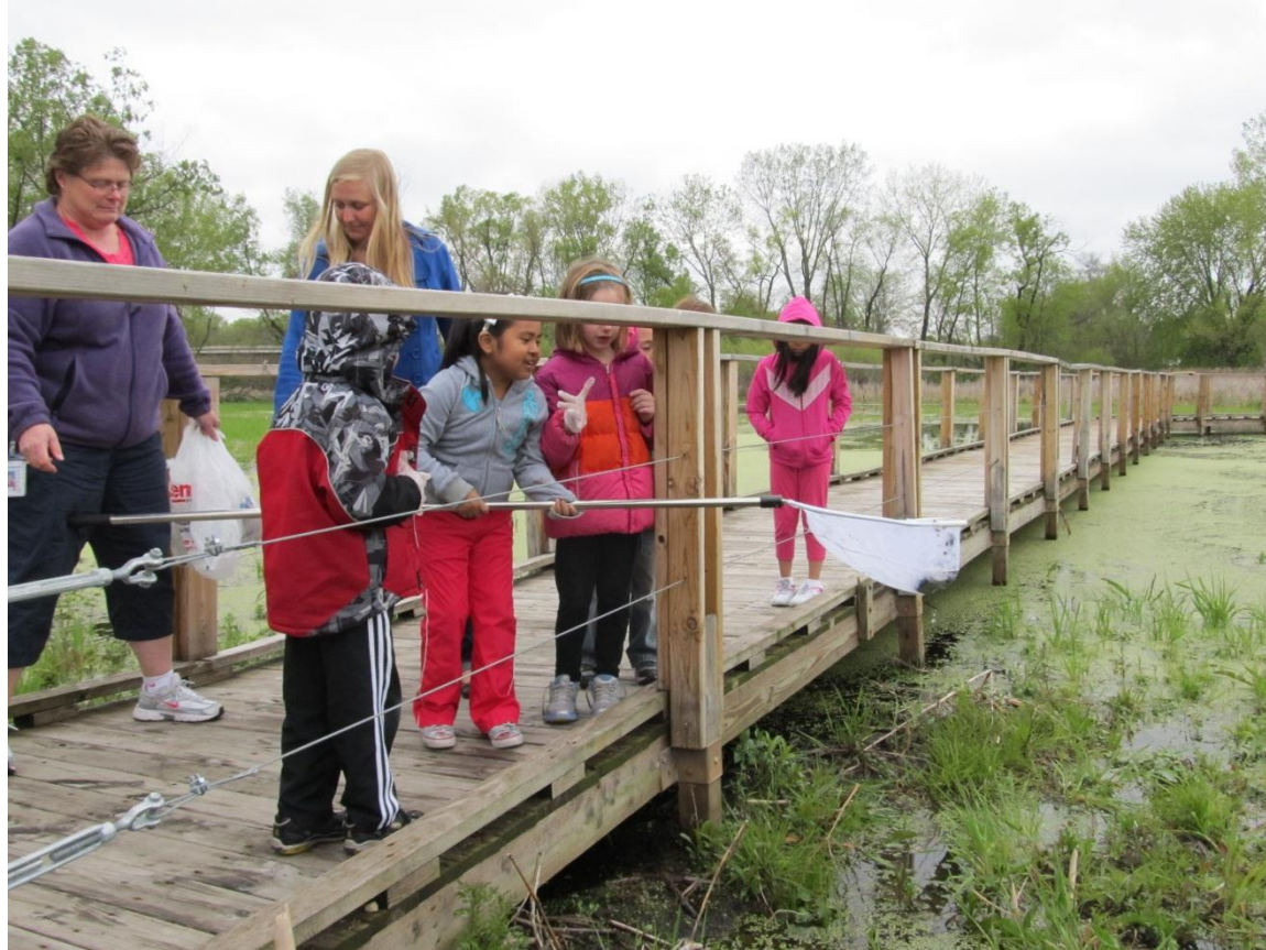
CLC Waterpark Green Team Wetland Walk