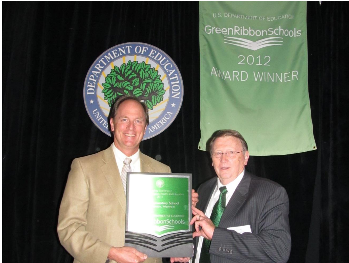
Green Ribbon Award Ceremoney Washington, D.C.