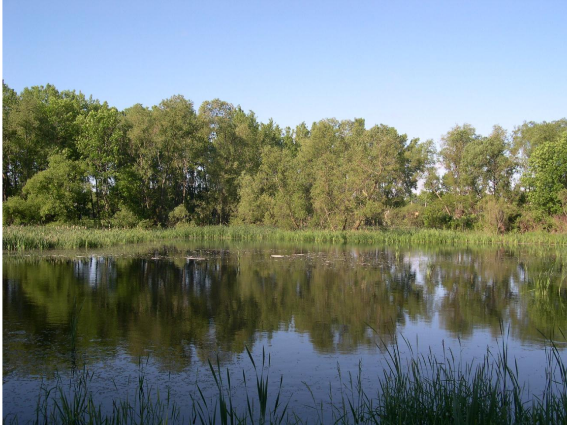
Our Beautiful Wetland