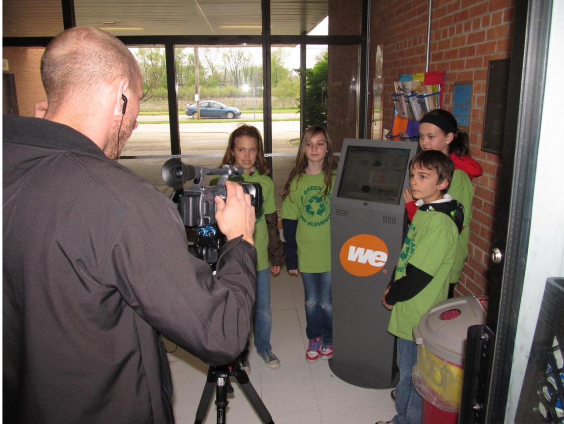
CLC Waterpark Green Team Wetland Walk