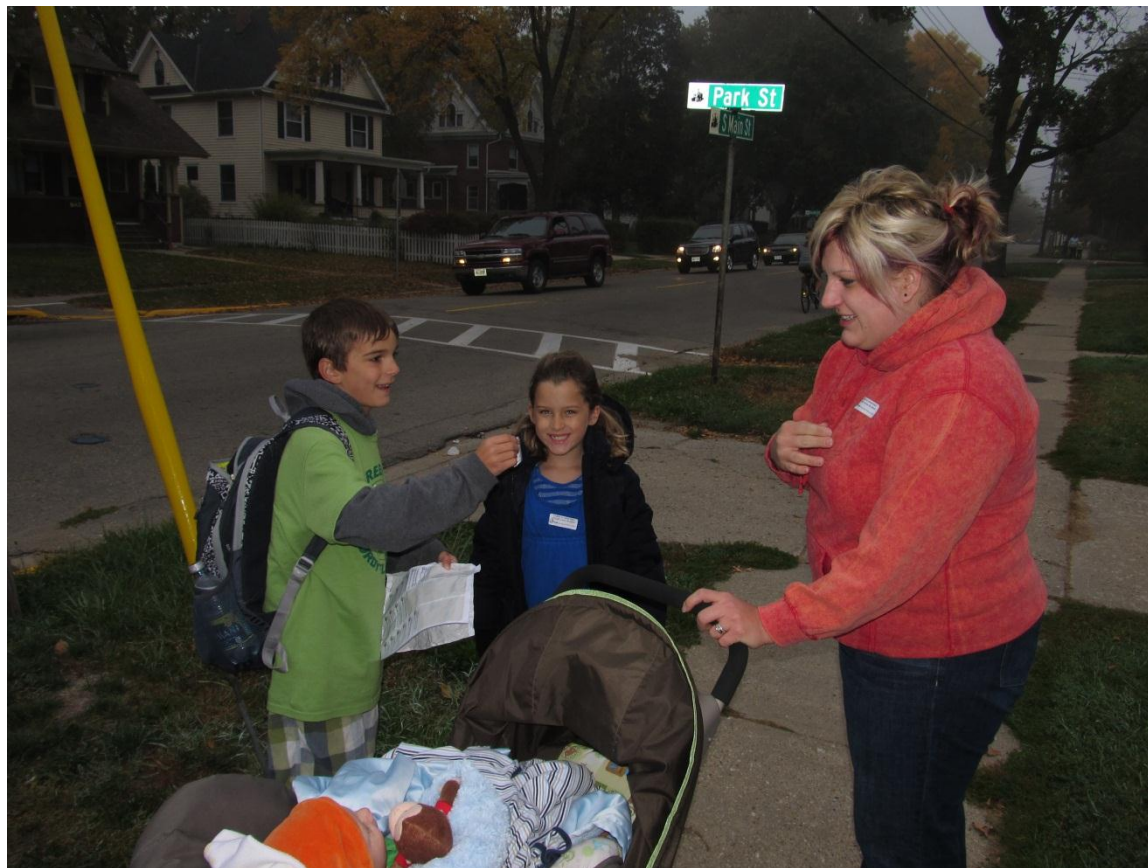
Green Team Walk to School Day