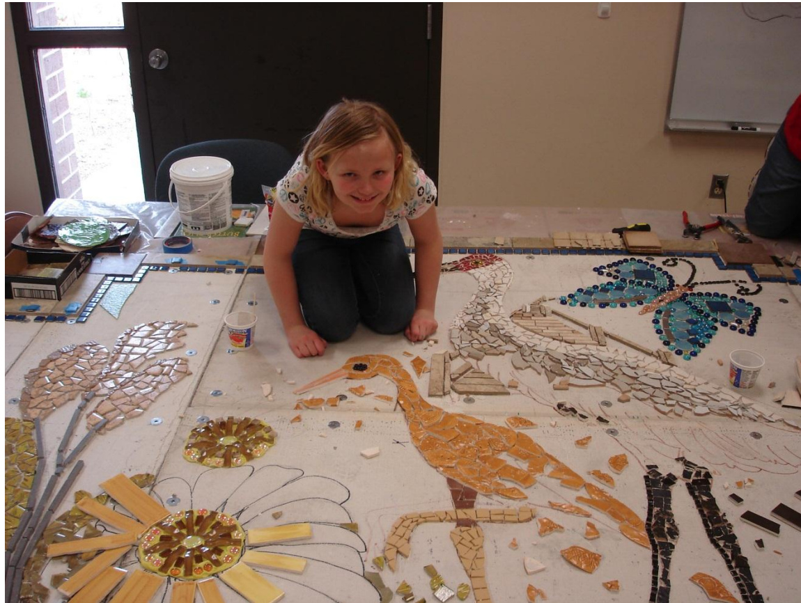
Mosaic Project – Wetland Theme